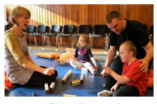
"He is making so much progress, music is definitely his thing and it's having an amazing impact on his development." Parent